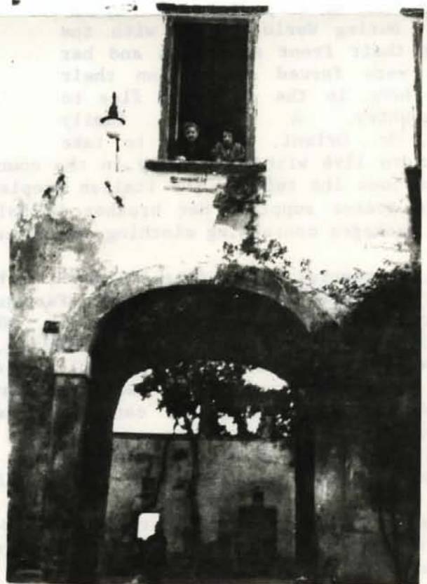
Pre-War home (1939)